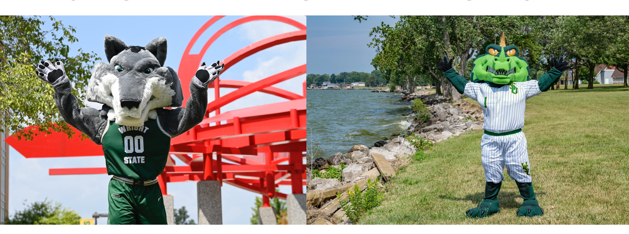
LET'S HAVE A GREAT YEAR